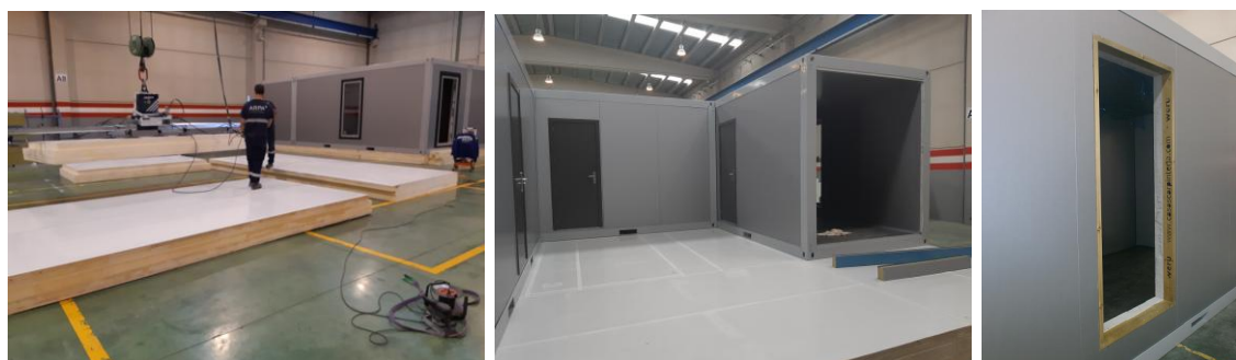
Figure 1: Pre-assembly carried out at ARPA's facilities

Outcome: The task was finished, with a delay of 9 months. Main objectives were achieved.