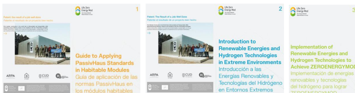
Figure 3. Covers of the 3 guides developed

Under Task C8.1, the three technical guides (C8.1, C8.2, C8.3) were published on the website of the project and disseminated to key stakeholders to support replication of the ZEROENERGYMOD solution. CUDZ targeted 32 stakeholders from defence, research, and industry, while FHa reached over 200 additional contacts through digital channels and key events. Distribution was mainly digital, with limited printed copies at key meetings, ensuring effective knowledge transfer across sectors. Outcome: The task was completed as scheduled.